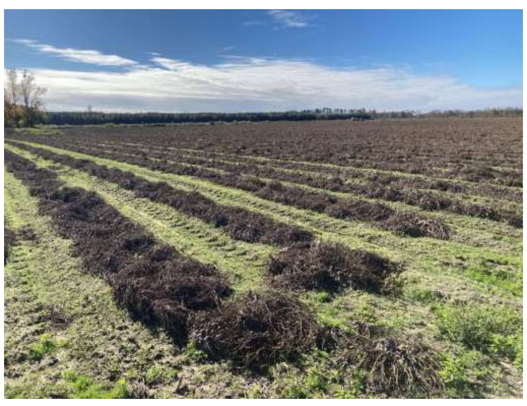
Peanut field near Oak City, North Carolina in early November.