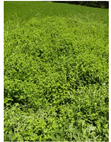
Figure 9. Tropical spiderwort infestation in peanut, Grady County.

Greatest residual control with Dual Magnum® can be obtained when the application is followed by at least 0.5" of rainfall or irrigation within 7 to 10 days. Dual Magnum® can be applied preplant incorporated, pre-emergence, and post-emergence in peanut. However, Dual Magnum does not provide postemergence control of tropical spiderwort. Less expensive, generic formulations of metolachlor, the active ingredient in Dual Magnum®, are available. These formulations may not provide the same length of residual control of tropical spiderwort because of reduced active ingredient rates (Parallel®, Stalwart®, Me-Too-Lachlor®).