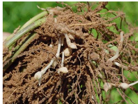
Figure 7. Tropical spiderwort subterranean flowers. [E.P. Prostko]