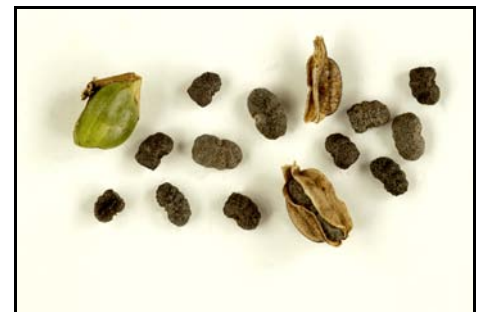
Figure 8. Tropical spiderwort seeds.

Tropical spiderwort has been identified as an alternate host of the southern root-knot nematode ( Meloidogyne incognita ) (Valdez 1968). A recent survey in Georgia has shown that the southern root-knot nematode is widely distributed across the cotton production regions of the state. In fact, southern root-knot nematodes were recovered from more than 65 percent of the soil samples collected in the survey. (R.C. Kemerait, University of Georgia, Extension Plant Pathologist, personal communication, 2003).