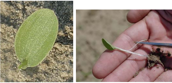
Figure 5a (left). One leaf seedling of tropical spiderwort. Figure 5b (right). Tropical spiderwort seedling with filamentous cotyledonary stalk.

grown from underground seeds, however, were capable of producing 8,000 seeds/m 2 , while those originating from aerial seeds produced 12,000 seeds/m 2 (Walker and Evenson 1985a).