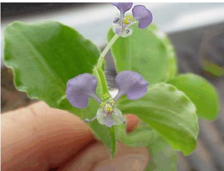
Figure 6. Tropical spiderwort aerial flowers. [A.S. Culpepper]

Plants that developed from aerial seeds tended to be smaller, developed aerial flowers earlier (43 days after emergence), and produced more aerial fruits relative to plants that originated from underground seeds (Walker and Evenson 1985a). The optimum depth for tropical spiderwort emergence was 0 to 2 inches, with large seeds capable of emerging from a 6 inch depth (Walker and Evenson 1985b).