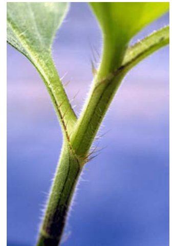
Figure 2. Reddish hairs at sheath apex. [H. Pilcher]

Results from a recent survey illustrates the distribution of tropical spiderwort in Georgia (Figure 4, page 2). Additionally, several county extension agents, particularly those near the Florida border, have ranked tropical spiderwort as the most important weed species in their county. The increase in the prevalence of tropical spiderwort in Georgia may be attributed in part to the adoption