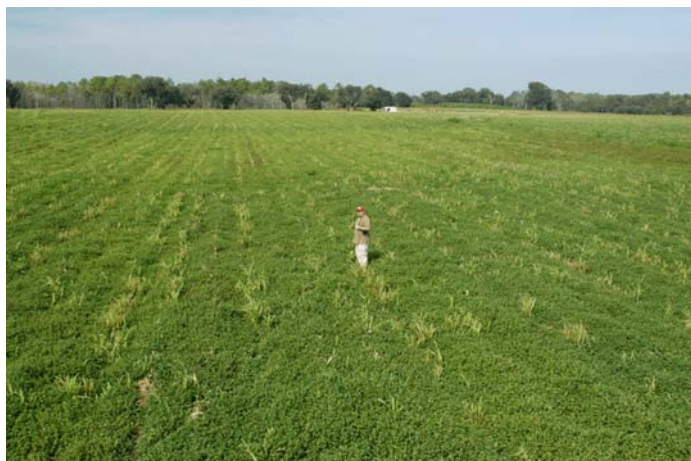
Figure 10. Tropical spiderwort infestation after corn harvest, Grady County. [A.S. Culpepper]

Because tropical spiderwort can germinate and emerge up until frost, growers must implement fallow or post-harvest control strategies in an effort to reduce seed production (Figure 10). This can be accomplished by using either tillage or herbicides. If fields are tilled, they should be cultivated every 3-4 weeks while tropical spiderwort is emerging. If herbicides are preferred, emerged tropical spiderwort plants can be treated with Gramoxone Max®, 2,4-D amine, or a combination of Gramoxone Max®+ 2,4-D. In order for post-harvest/fallow herbicide treatments to be effective, they must be applied after the