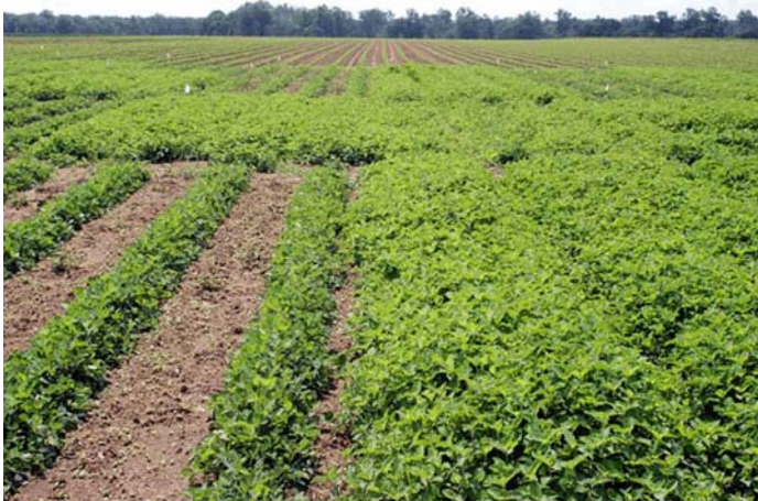
Figure 1. Tropical spiderwort in peanut, Grady County, 2004. [E.P. Prostko]