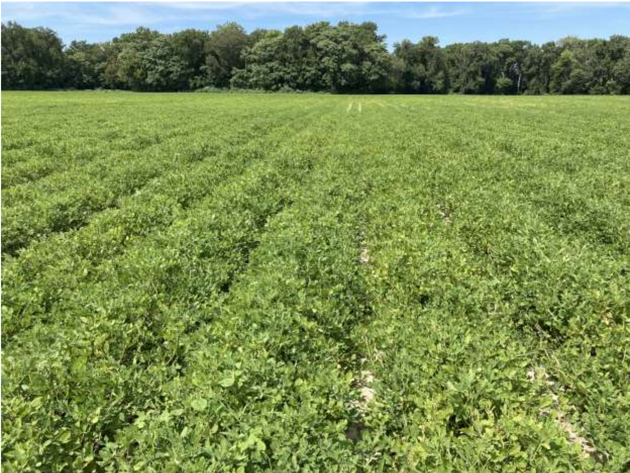
Peanut fields near Hamilton in northeastern North Carolina.