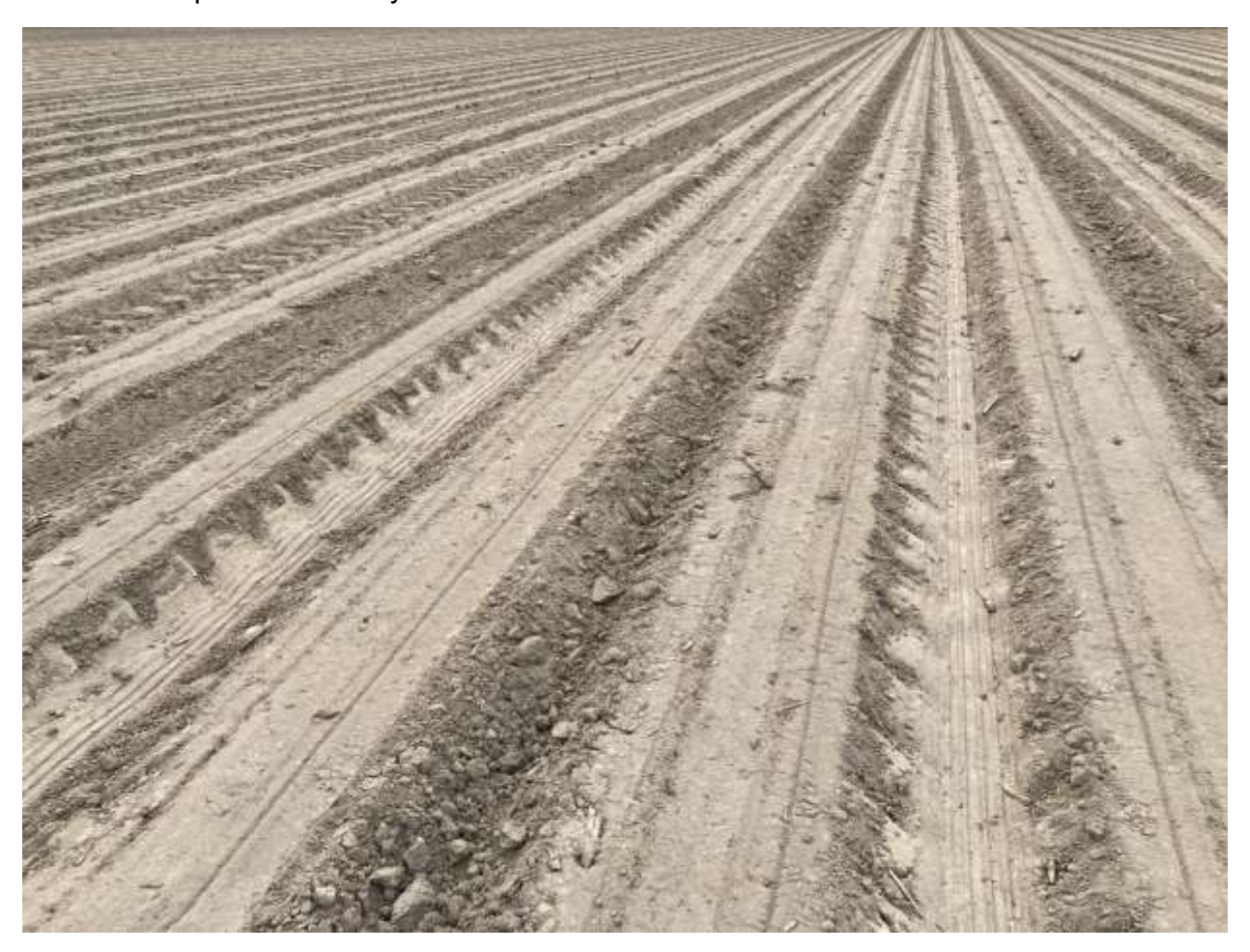
Peanut field planted on May 18 near Lewiston-Woodville in northeastern North Carolina.