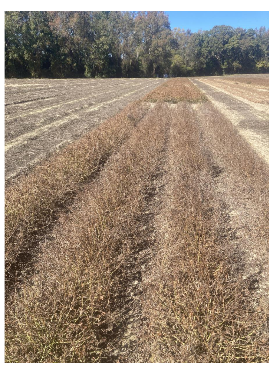
Freeze damage before and after digging