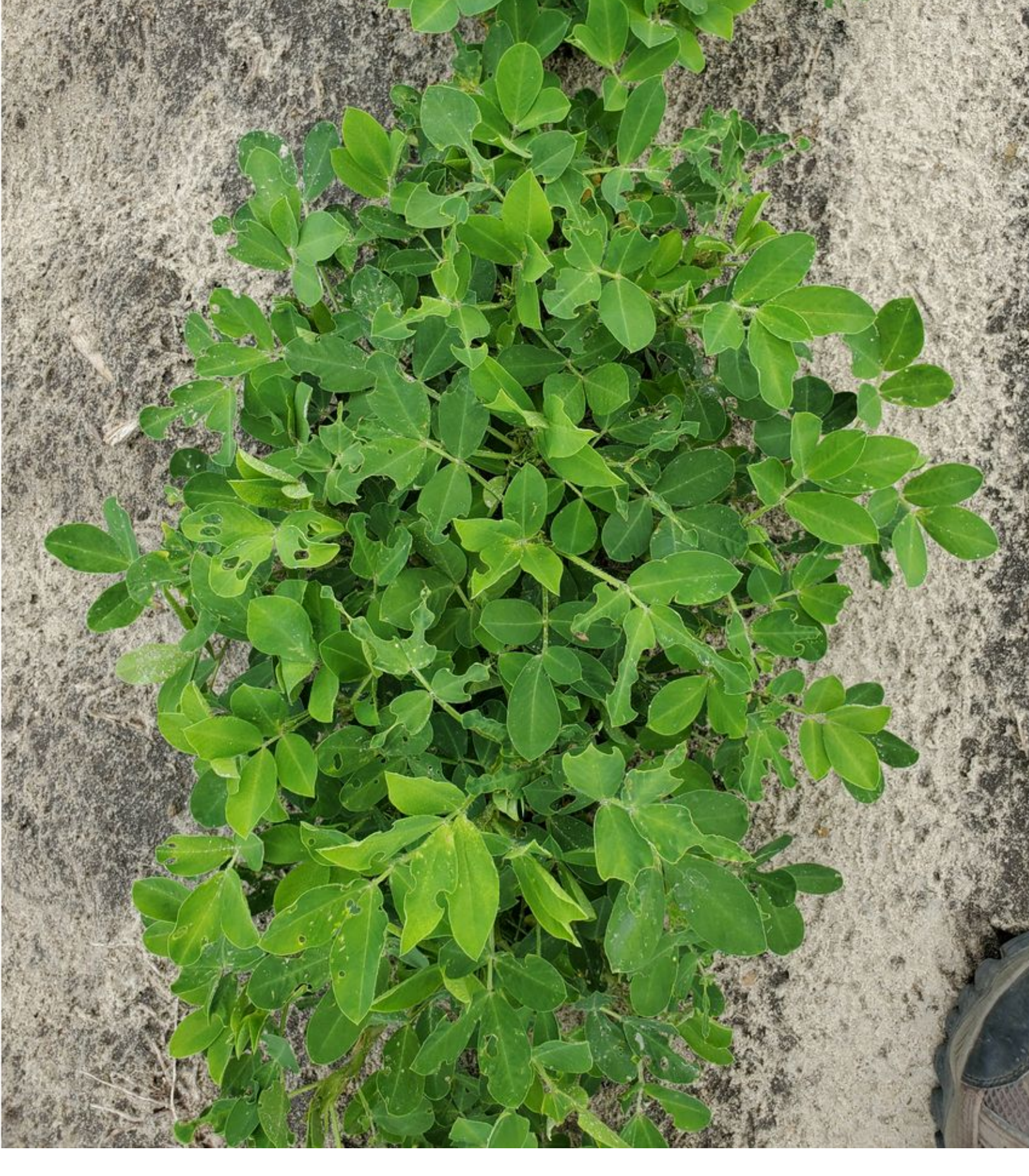
Minor amount of feeding from caterpillars (worms not observed here)